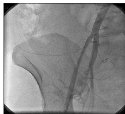
Fig. 3. Angiogram showing no further bleeding.