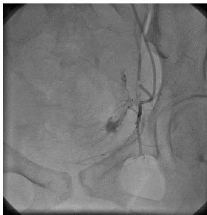
Fig. 1. Active bleeding from left uterine artery.

During pregnancy the uterus, vagina, and vulva have rich vascular supplies that are at risk of trauma during the birth process; trauma to these highly vascular areas may result in formation of a haematoma. Puerperal haematomas occur in 1:300 - 1:1 500 deliveries and, rarely, are a life-threatening complication of childbirth. [10,11] Vaginal/paravaginal haematomas result from injuries to branches of the uterine artery, mainly the descending branch. [12] These haematomas are usually