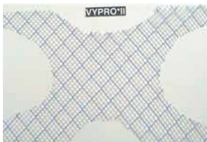
Fig. 1. Self-tailored mesh, with a centre and four arms.

In group B, anterior colporrhaphy was done using a tailored non-absorbable, low-weight, monofilament, macroporous, vicryl-polypropylene mesh (VYPRO mesh, Johnson & Johnson Inc.) (Fig. 1). Four arms were made from a 6 × 11 cm mesh patch. The anterior border of the mesh was slightly curved to avoid covering the urethrovaginal junction. After separating the fibromuscular layer from the mucosa of the anterior vaginal wall, four tunnels were made by sharp and blunt dissection so that the arms of the mesh could be fixed in place. The anterior tunnels were made along the inside of the inferior rami of the pubic bone, dissecting the fibromuscular layer towards the obturator foramina but not reaching through the obturator membrane. The posterior tunnels were made by dissecting the fibromuscular layer towards the ischial spine. Site-specific repair was done using interrupted 2-0 vicryl sutures. The central area of the mesh was fashioned according to the size of the cystocele. The tailored mesh was placed over partly repaired bladder fascia,