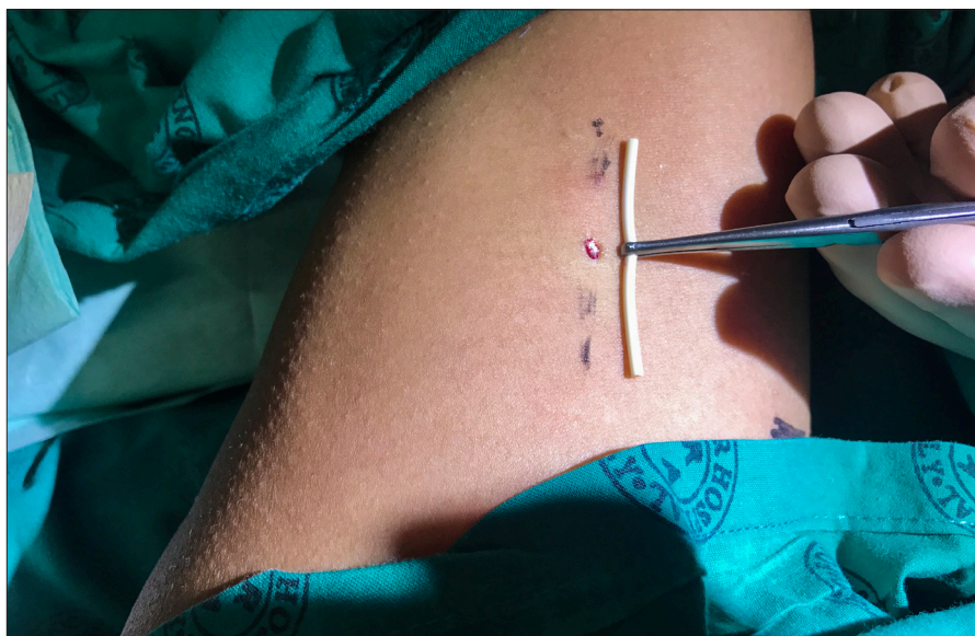
Fig. 1. Implant in modified vasectomy clamp, showing the small incision.

The consumables or equivalent replacements are generally available in all clinics where minor surgical procedures are performed.