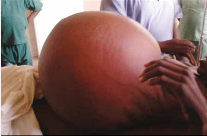
Fig. 1A. Grossly distended abdomen and veins in a patient with ovarian tumour.