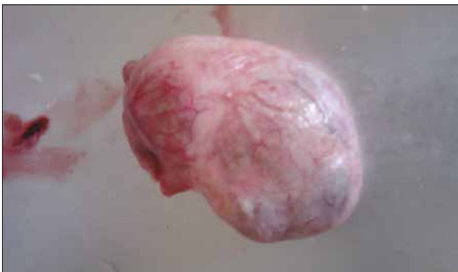
Fig. 1C. Gross appearance of right ovarian papillary serous cystadenoma weighing 2 kg.

tested negative for HIV and the hepatitis B surface antigen (HBsAg). The patient's urinalysis, plain chest X-ray, fasting blood sugar and liver function tests were all normal. A urinary pregnancy test was negative and an abdomino-pelvic ultrasound scan revealed a huge multiseptated, cystic intra-abdominal mass arising from the pelvis, with mixed echogenicity and a thick wall. Measurements of the mass were beyond the capacity of the probe. The liver and spleen appeared normal but the kidneys had dilated calyces. The uterus was not visualised. She was counselled for exploratory laparotomy and consented on condition that her uterus be preserved. Findings