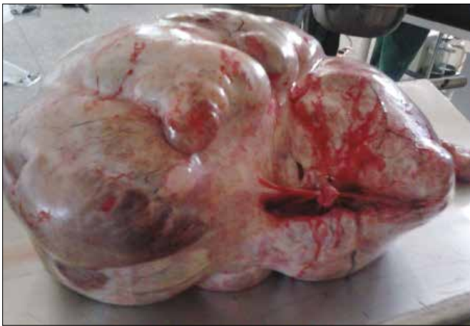
Fig. 1B. Gross appearance of left ovarian benign cystic teratoma weighing 55 kg (ventral view).